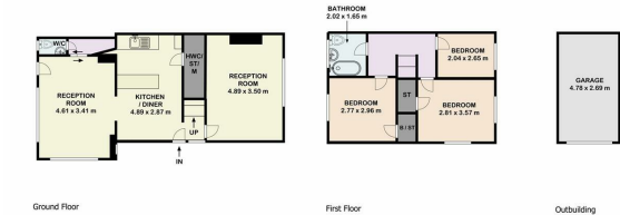
Ground Floor Claremont Crescent, DA1 4RJ

The plan is intended solely as a layout guide, and no liability is assumed for any errors, omissions, or inaccuracies. It does not constitute a contract, nor does it constitute a warranty. Any intending purchaser or tenant should satisfy themselves, through inspection, as to the accuracy of the information provided. All areas, measurements, photos, drawings, floorplans, and other information are given as a guide only and should not be relied upon for any purpose. The plan is provided for information only and should not be relied upon for any purpose. The plan is provided for information only and should not be relied upon for any purpose.